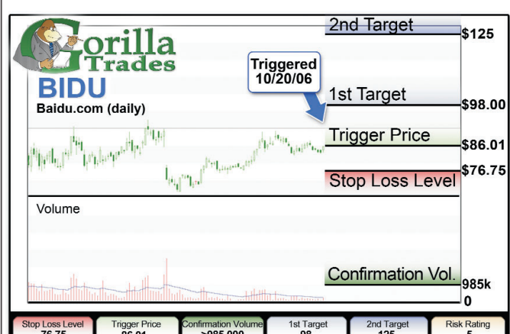
Pictured above is a graph of Baidu.com (BIDU), which was recommended to GorillaTrades subscribers on 10/20/06. BIDU currently holds more than 134% unrelentingly gain. Its stop has been raised to $130 and its second target currently stands at $241; both of which have been raised weekly.

GorillaTrades then continues to actively track these stocks, regularly updating stop loss levels and second targets as needed. This guidance helps subscribers lock in profits and minimize any losses. The beauty of GorillaTrades is that it's simple, yet highly effective. The system allows you to invest on a level playing field with professionals, without the research time. There is a good reason why GorillaTrades has subscribers in 55 different countries, and has become one of the fastest growing, most highly respected investing systems in the world. Now is the time to take your portfolio to the next level!